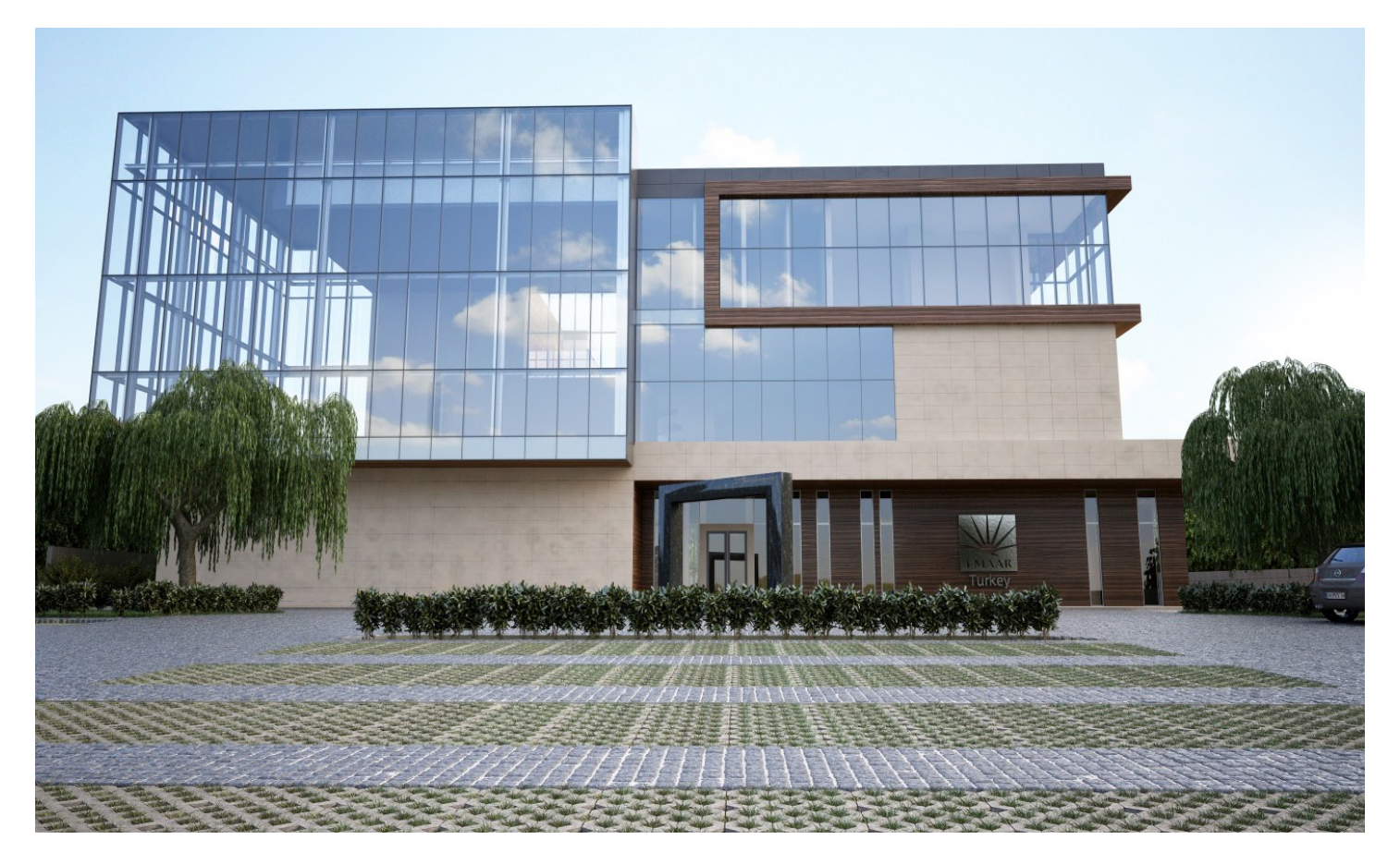
The project makes use of GOSS Apollo Limestone wall thickness with a sandblasted surface finish. The roof terrace cladding, this is in a 1200mm x 600mm size and 30mm tile