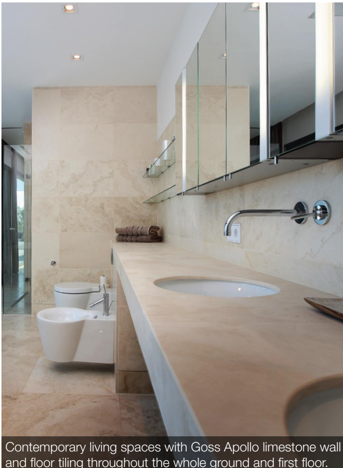
Contemporary living spaces with Goss Apollo limestone wall and floor tiling throughout the whole ground and first floor.

The quality is in the detail and that is apparent by the beautifully crafted kitchen and bathrooms. These living spaces incorporate seamless flooring which continues from inside to outside in stunning honed Goss Apollo limestone.