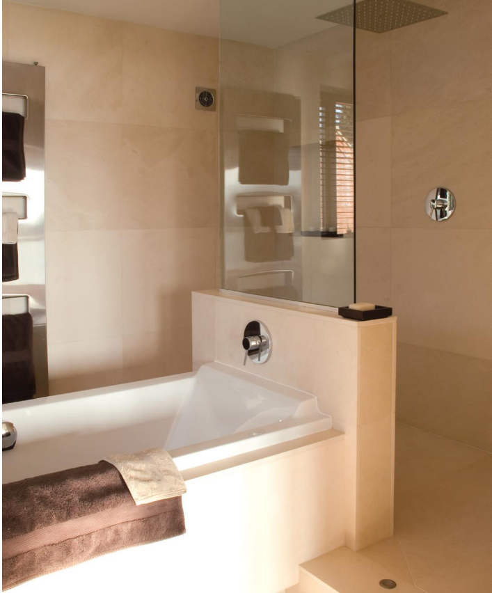
Magnificent contemporary master bathroom with Goss Apollo limestone wall and floor tiling throughout.